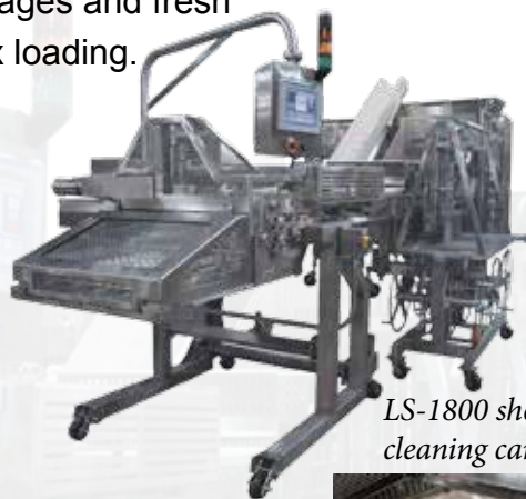
LS-1800 shown with cleaning cart option.